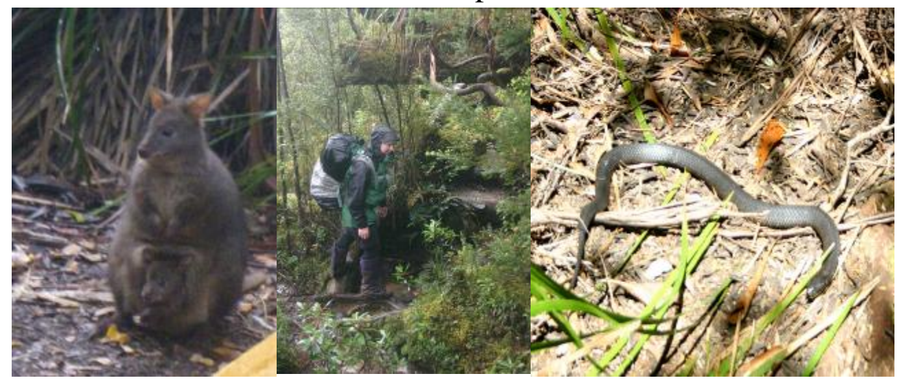
Above left: Paddymelon wallaby with young in pouch. Centre: The track conditions. Above right: This was tiger country... Including the reptilian type.